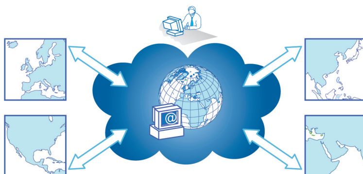
Reliance Globalcom's low latency, private IP backbone from and to Asia, Europe, the Middle East and the USA